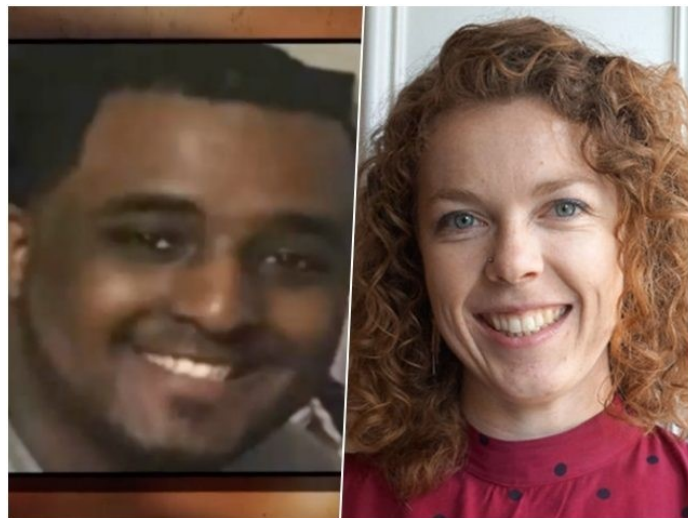
Rabid N*gger Ape and Its Victim