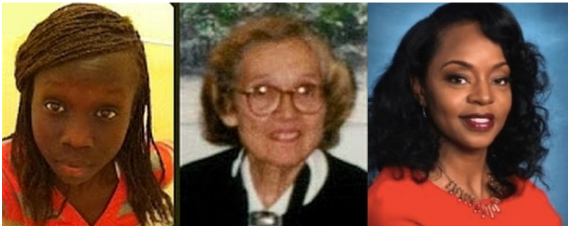
Niggess psychopath, 93 year-old Victim and Stupid N*gger Judge