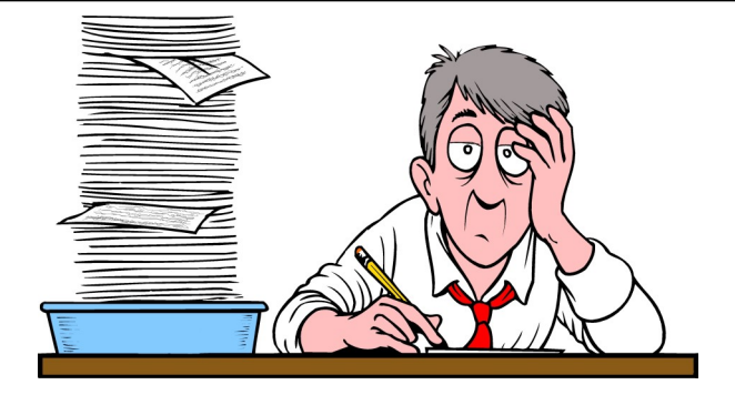
LETTERS, MUSINGS & ASIDES

Submit Letters directly to the Editor: Citizens Informer P.O. Box 250 Potosi, MO 63664-0250