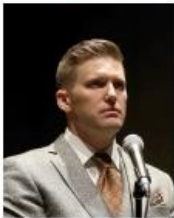
RICHARD SPENCER Director of the National Policy Institute, leading national figure of the Alt-Right