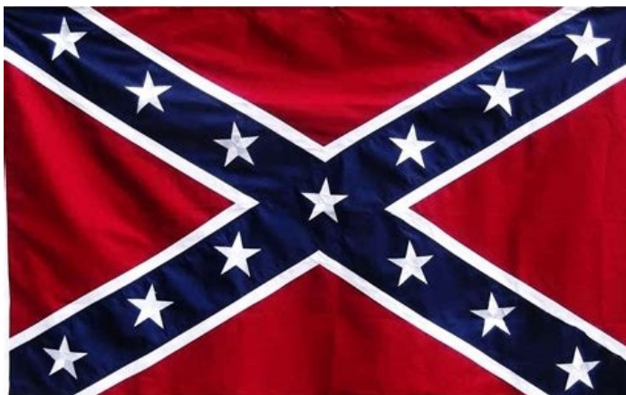
Confederate Battle Flag

The UDC claimed its behavior toward the Flaggers was un-chivalrous because it feared jeopardizing its tax-exempt status by welcoming "political activists." A more honest explanation is the UDC recognizes that its own efforts appear timid and confused in contrast to those of the Flaggers . The UDC's leadership alleges that it is an honored tradition not to display the Battle Flag in a "casual" manner to avoid "trivializing" it, but a better explanation is that the Battle-Flag has become an embarrassment to them.