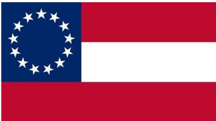
First National Flag

For decades, the UDC has surrendered ground to those who wish to perpetuate Sherman's March and who would eradicate the history and heritage of the Southland. After the Senate voted against extending the UDC's trademark in 1993 -- because it included the Battle Flag -- the UDC meekly abandoned the Confederate Battle Flag by voluntarily removing it from its logo and replacing it with the First National . The Cultural Marxists will inevitably target that flag, as well.